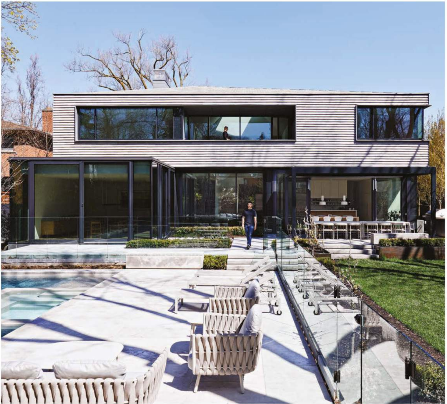
↑ The back of the home reveals its hipped-roof design and upper walkout. Build by Mazenga; landscaping by Fox Whyte; Tribù furniture from Avenue Road.